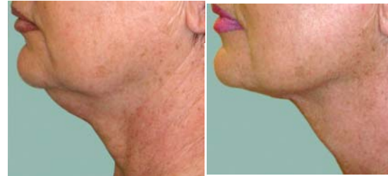
Submental Pre Submental 5 Month

Addition of laser-lipolysis to the armament of liposuction delivers minimally invasive tissue tightening and skin retraction, improves surgical outcome and expands population of patients that can benefit from the procedure without additional surgery.