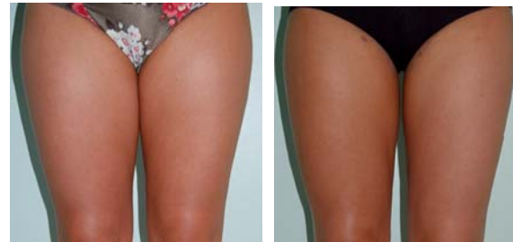
Medial Thighs Pre Medial Thighs 5 Month